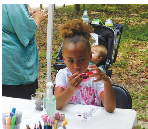
History Lives Here Coloring Project

their families from as far away as Oregon and Vienna, Austria. As always we are happy to share our local history with the world. The Library welcomes school field trips to our sites – Zion Chapel of Ease Cemetery and Ft. Mitchel. This gives students a chance to walk through a place in history while docents provide fun facts and introduce students to living history characters who tell the stories of the roles they play in Hilton Head's history. We will also bring history to local classrooms. Docents and living history characters are available to visit local classrooms and present programs based on what students are learning at the time. School classes are welcome to attend our history and ancestry classes. We