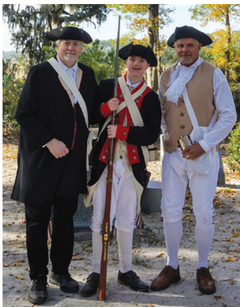
Living history characters support field trips and classroom visits.

Our students are back in school and the Library is busy providing educational experiences and materials to students, teachers and parents. We kicked off the school year again with Family Fun