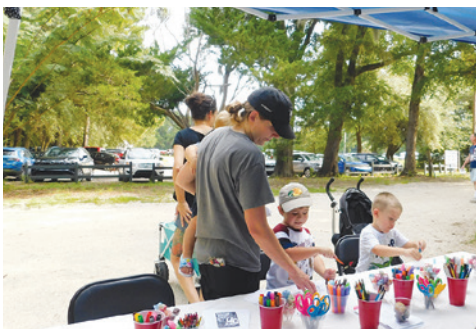
Students helped color Hilton Head historic figures

Day at Coastal Discovery Museum on August 10th. There were lots of opportunities for children to have fun while learning. Participating organizations, groups and authors met with families and introduced them to the many educational resources available on Hilton Head Island. This year more than 700 people attended. The Library