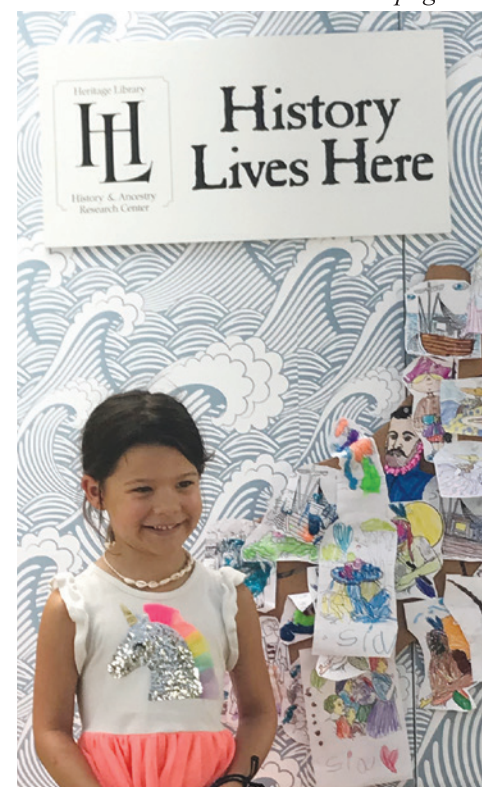
A visitor from Vienna, Austria joined us for Family Fun Day