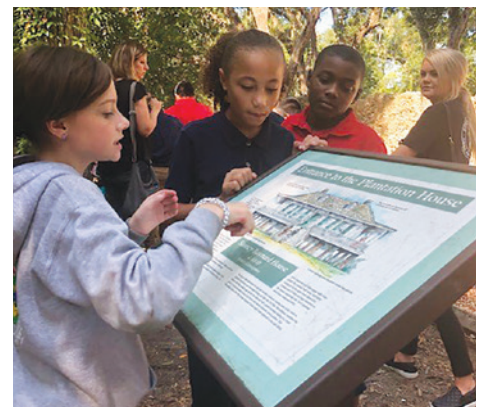
Field trips enhance classroom lessons

Thanks to the generosity of local groups including Heritage Classic Foundation, Peeples Foundation, Bargain Box and Herb Society, as well as our community donors, we offer all this to schools at no cost. If you want to learn more about local history and bring that knowledge to any of your classrooms, please call 843.686.6560.